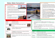
Year 2– Water, Water Everywhere