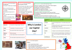
Year One– Why is London our Capital?